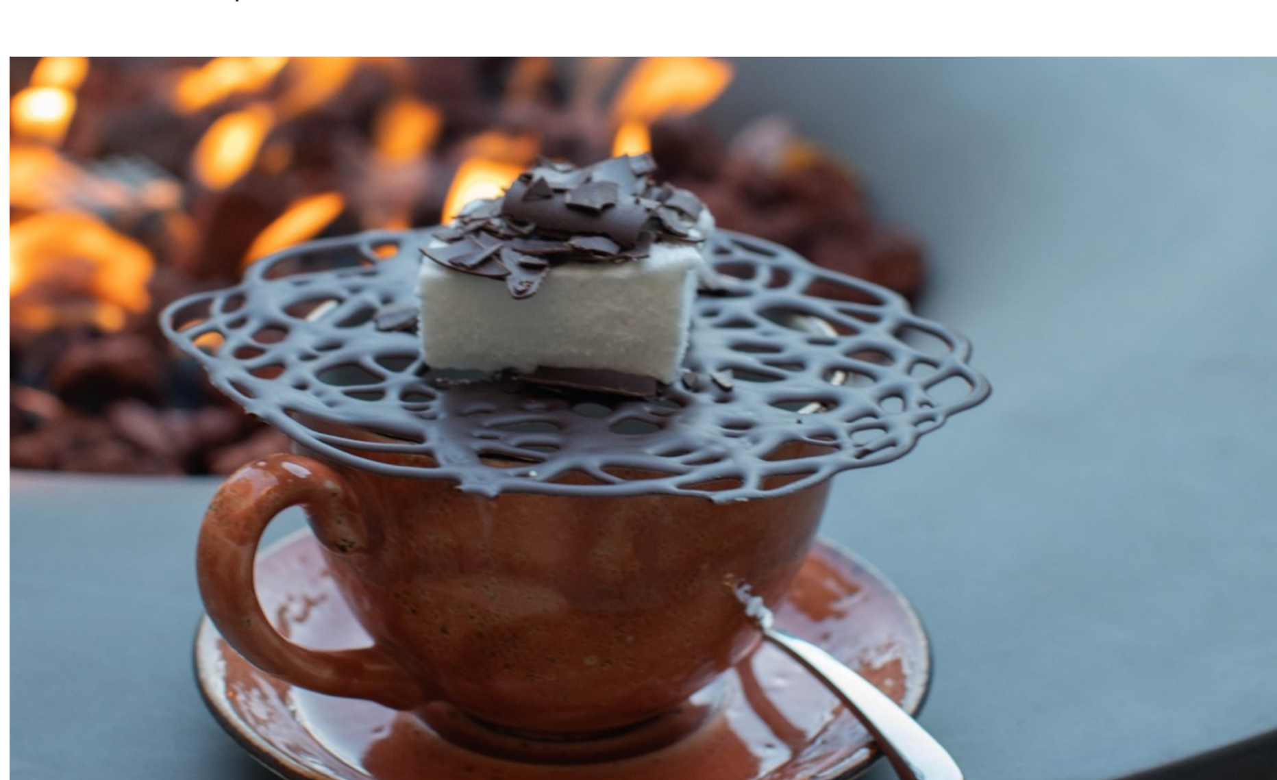
Remedy Bar's Haut Chocolat at The Four Seasons, Vail.

Two posh ski resorts in Vail are prime destinations for fanciful hot chocolate. At The Sebastian, a gold dusted sphere of Valrhona milk chocolate is immersed in a cup of dark hot cocoa spiced with cinnamon, star anise, vanilla and cloves. The hot cocoa melts the sphere revealing marshmallows and chocolate crunch pearls.