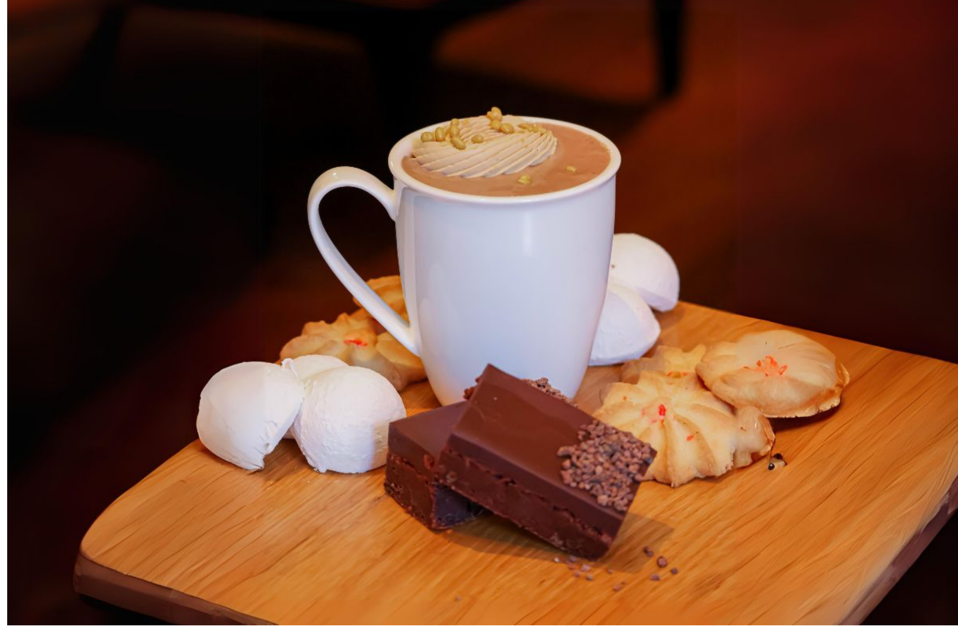
Hot chocolate with caramel whipped cream at The Ritz-Carlton, Boston.