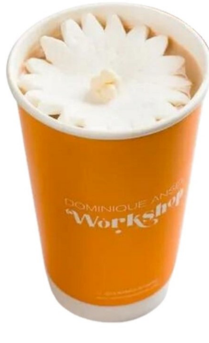
Dominique Ansel's blossoming hot chocolate.