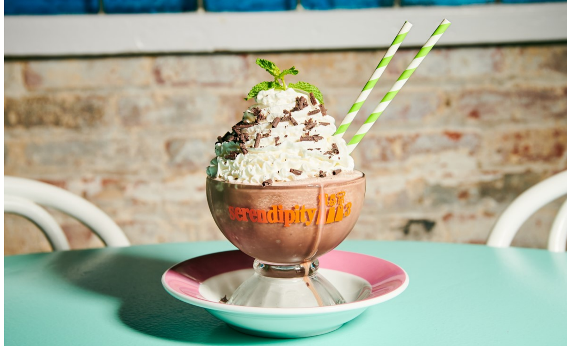
Frozen Hot Chocolate, Serendipity 3.

The artisanal Kakawa Chocolate Company uses a different cacao profile: drinking-chocolate elixirs based on recipes from historical sources. At shops in Santa Fe, NM, and Salem, MA, Kakawa concocts elixirs ranging from pre-Columbian to colonial American, and from French lavender to modern Mexican. The unsweetened Aztec Warrior is made with 100% chocolate, herbs, flowers, nuts, spices, Pasilla de Oaxaca Chili, and Madagascar vanilla; Salem Spice recalls the black pepper trade in colonial America, pairing 33% white chocolate with cinnamon, ginger, nutmeg, black pepper and vanilla.