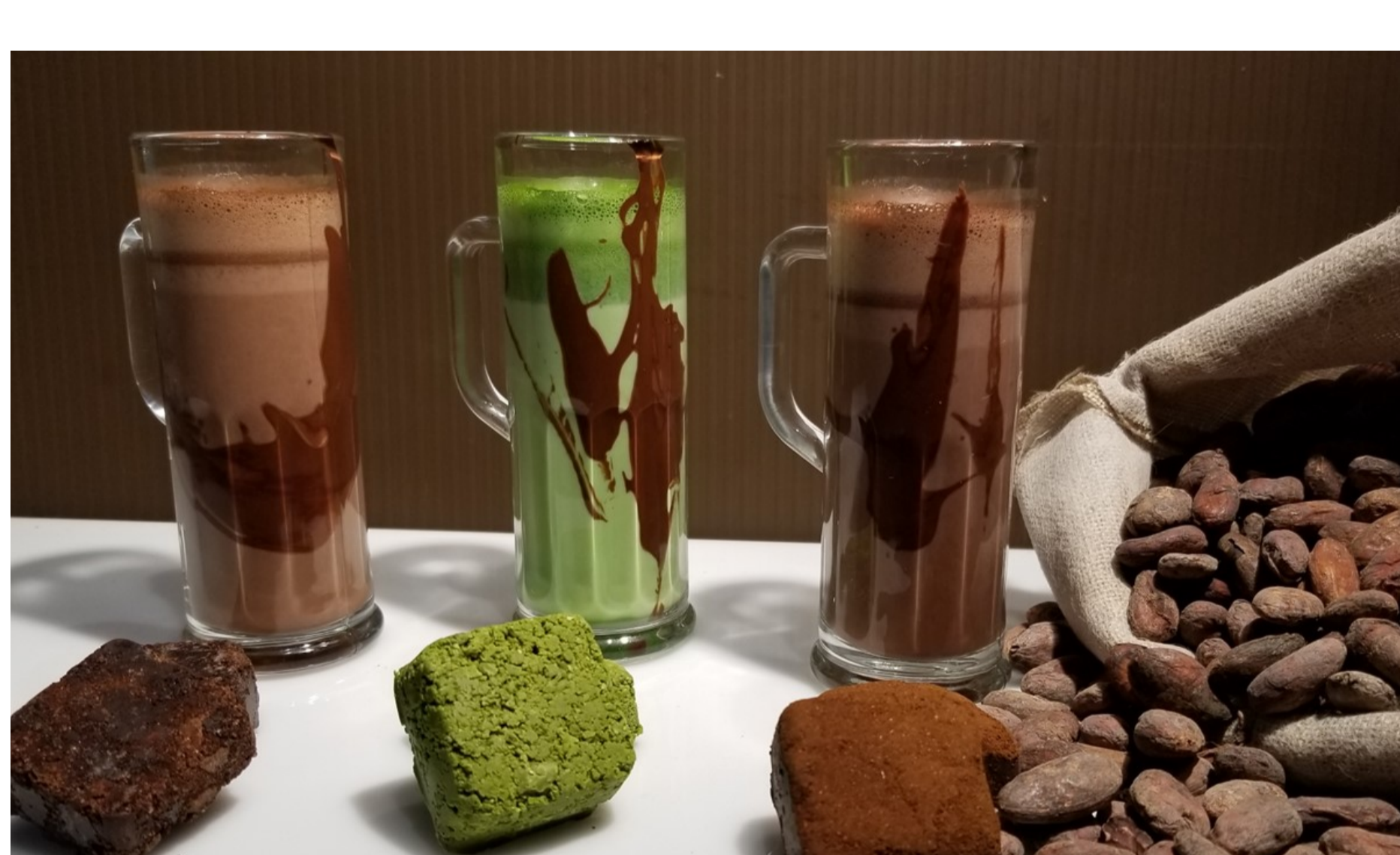
Koko Monk hot chocolate flight from scratch.